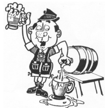
Oktoberfest September 18